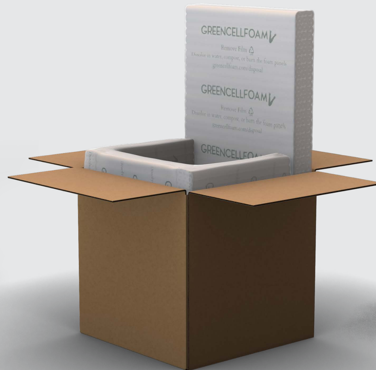
Compostable insulation with a range of applications.