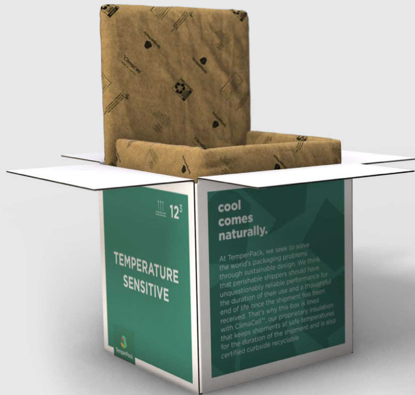
Curbside recyclable insulation for high velocity last mile operations.