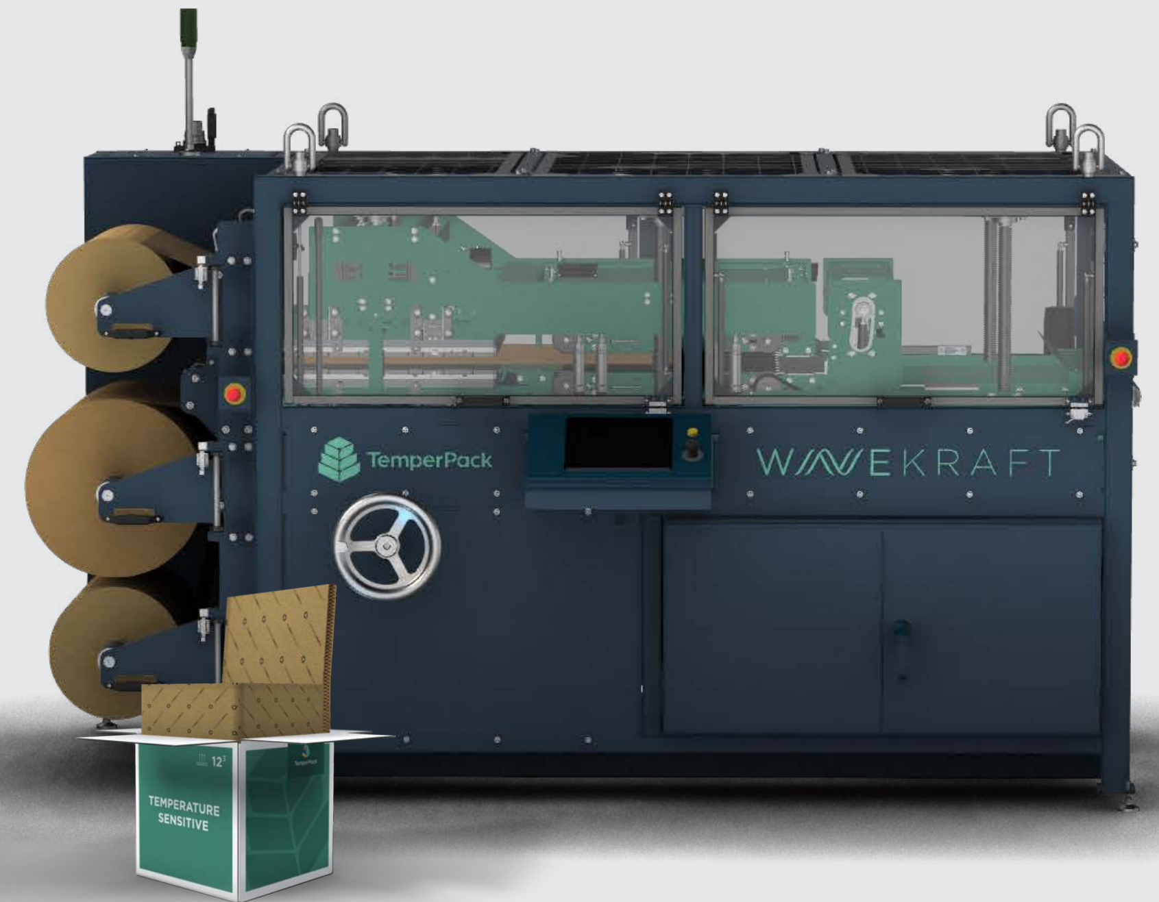
On-site, on-demand system designed for ultimate efficiency and flexibility.